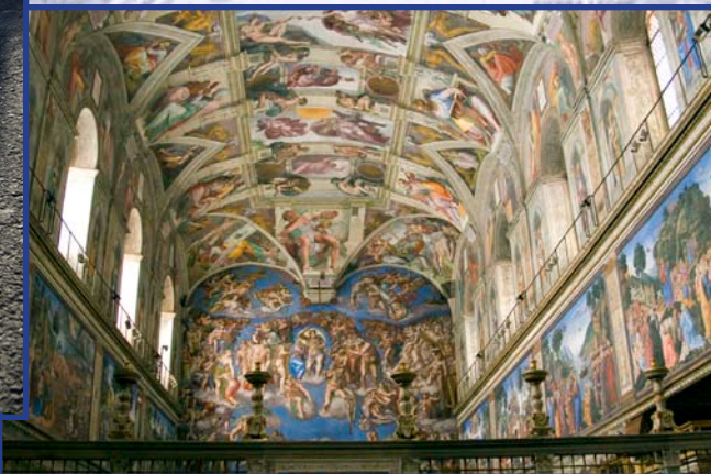
Indoor Air Quality

6050 Peachtree Pkwy Suite 240-187 Atlanta, GA USA 30092