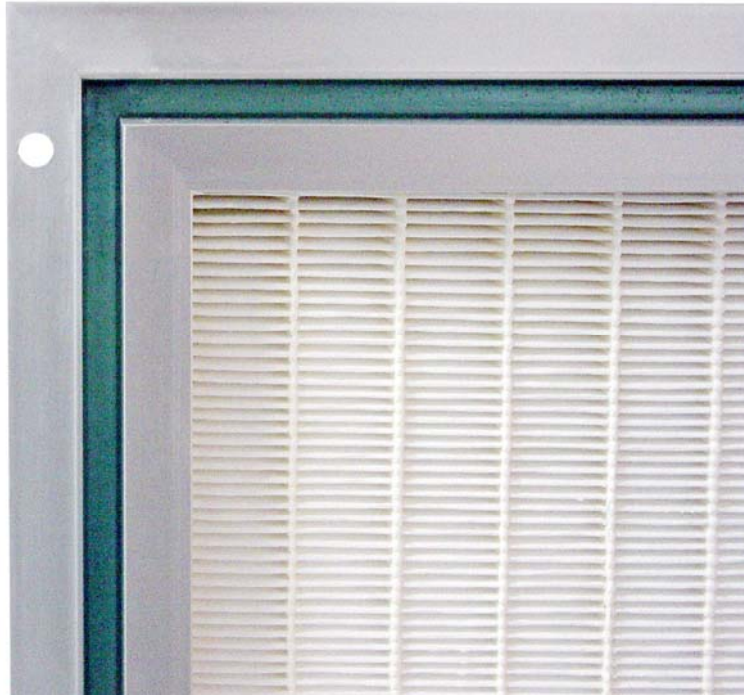
Tri-Pure Panel Filter showing the Reverse Perimeter Gel Seal Track and Flange used to mount in the module

In addition to the TRI-PURE GSR 2 Tri-Dim offers the TRI-PURE GSR Gel Seal Replaceable Hood – this is our premium module that offers a full range of features including an optional aerosol injection port.